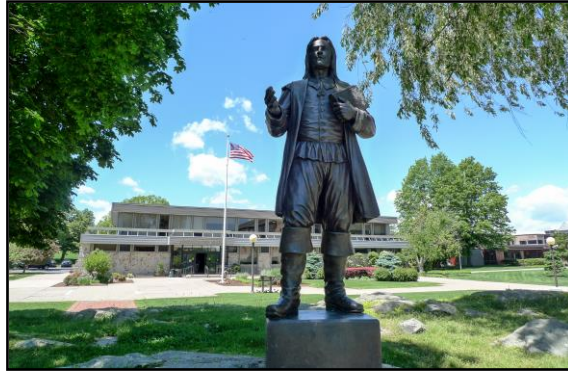
A statue of Roger Williams at the Roger Williams University, Bristol, Rhode Island, USA