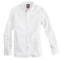
The Ripley Academy Uniform