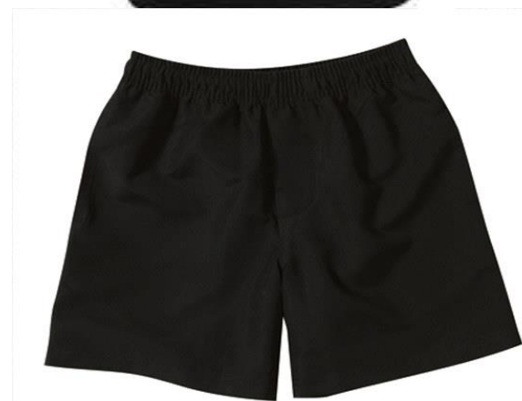
Basic PE Kit