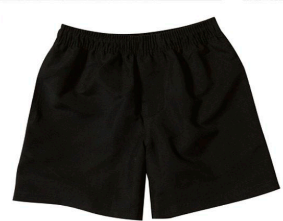
Basic PE Kit